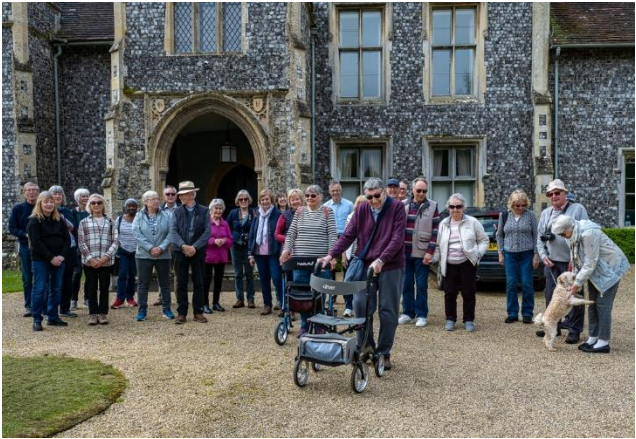
The Group at Elsing Hall

Our trips this year have included private visits to Elsing Hall and High View House, Roughton. In May we visited Elsing Hall which has 10 acres of beautifully maintained gardens, including a terraced garden overlooking the moat, which surrounds the manor house.