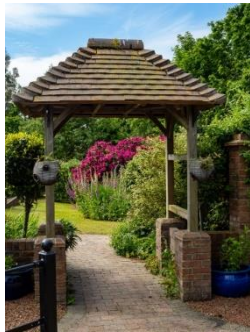
High View House, Roughton